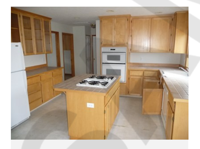
Area: Kitchen Repair For: Flooring & Steps - Vinyl