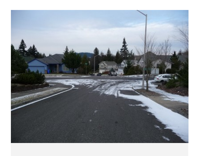
Subject Property Street View