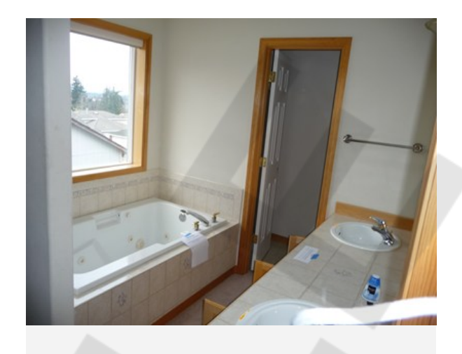
Area: Bathroom 2 Bathroom Photo