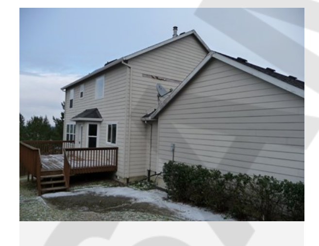
Subject Property Back View