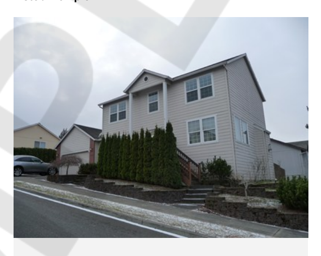
Subject Property Additional Marketing Photos