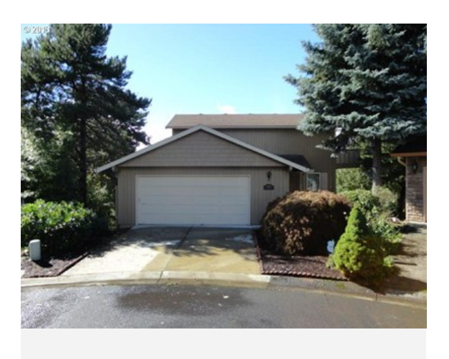
Subject Property Listed Comp 2