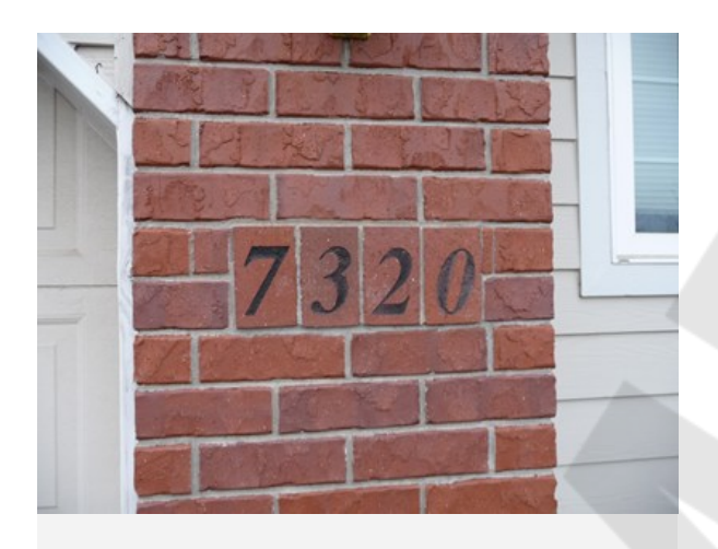
Subject Property House Number

MLS#: 13606148 Bedrooms:4 Baths:2.1 Year Built:1999 Total Living Area:1,988 SF Property Type: Single Family Detached Bluebook ID#: 11201 Inspection Date: 12/6/2013 Date Printed: 1/9/2014 10:04:21 PM (UTC)