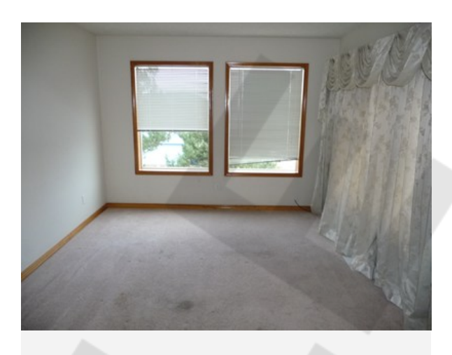
Area: Family Room Family Room Photo

Area: Living Room Repair For: Flooring & Steps - Carpet