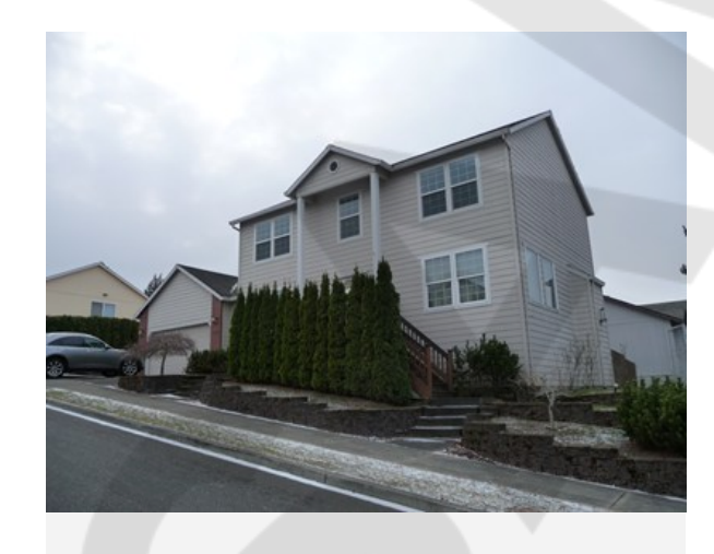
Area: Exterior Grounds Exterior Grounds Photo