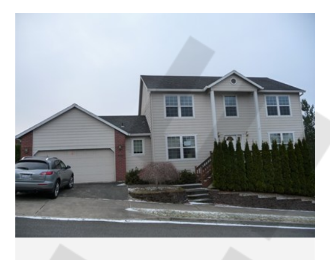
Subject Property Front View