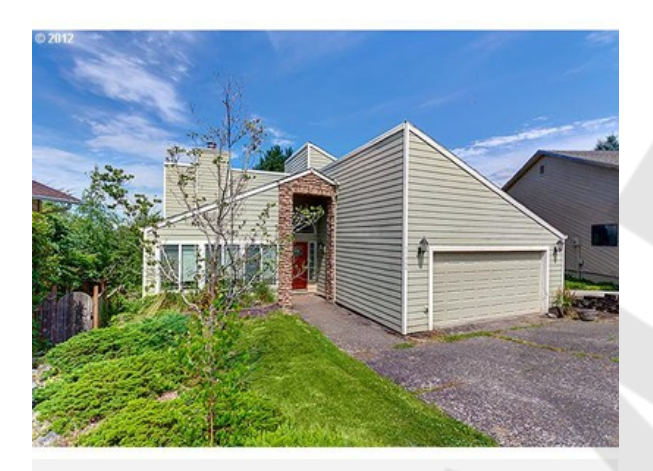
Subject Property Closed Sale Comp 1