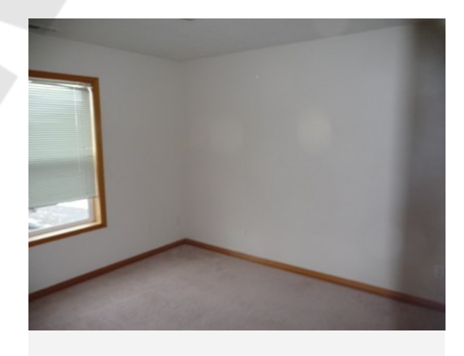
Area: Bedroom 4