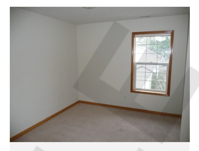
Area: Bedroom 2 Repair For: Flooring & Steps - Carpet