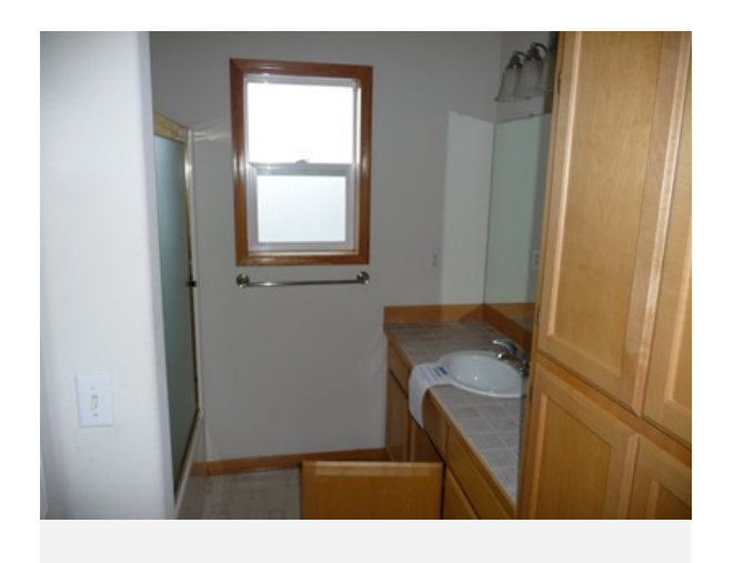
Area: Bathroom Bathroom Photo