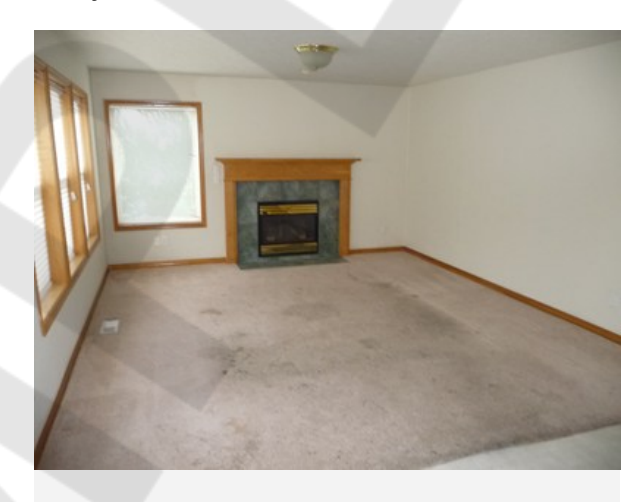
Area: Living Room Living Room Photo