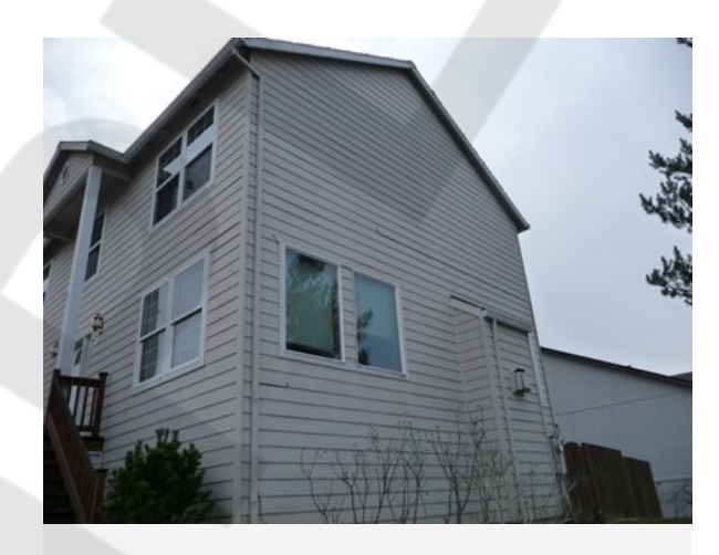
Subject Property Right Side