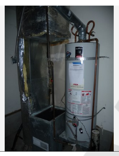
Area: Systems Repair For: Heating - Forced Air