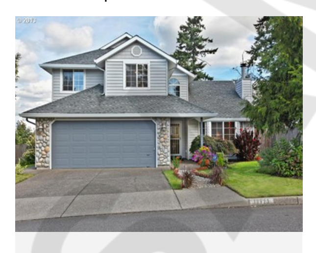
Subject Property Closed Sale Comp 3