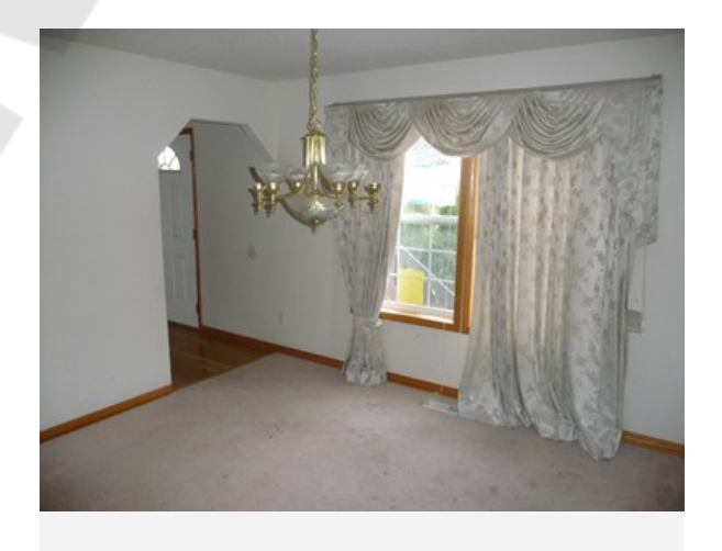
Area: Dining Room Dining Room Photo