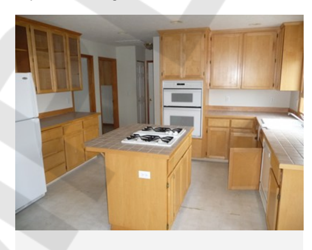
Area: Kitchen Kitchen Photo