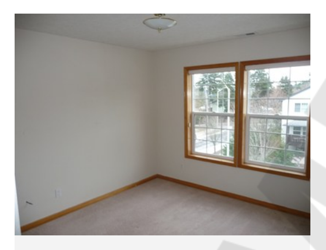
Area: Bedroom 3 Bedroom Photo