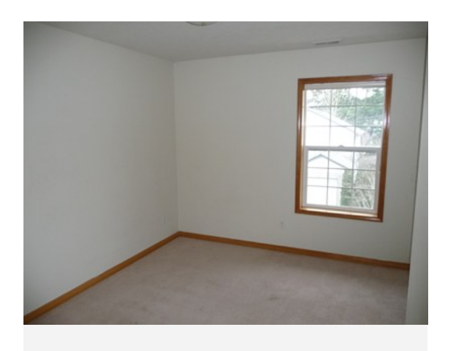
Area: Bedroom 2 Bedroom Photo