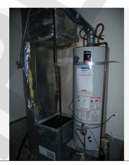
Area: Garage Garage/Carport Photo