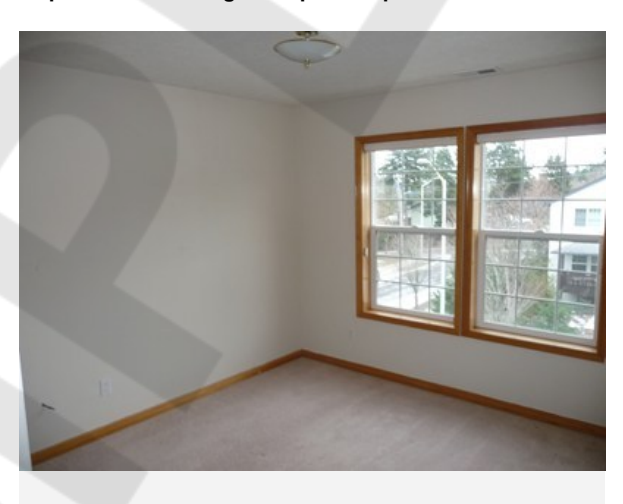
Area: Bedroom 3 Repair For: Flooring & Steps - Carpet