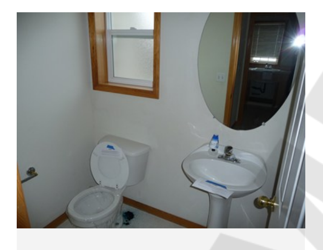
Area: Half Bath Half Bath Photo