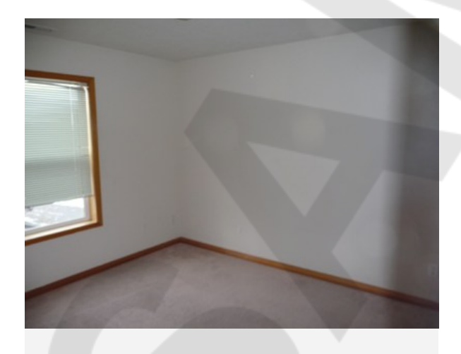
Area: Bedroom 4 Bedroom Photo