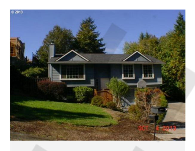
Subject Property Listed Comp 3