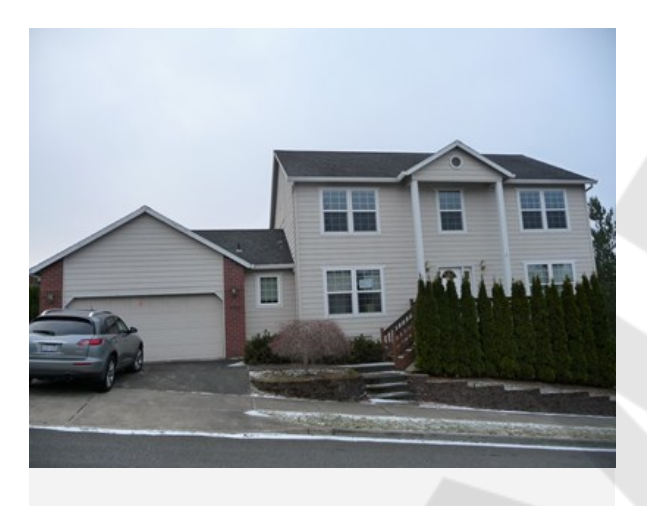
Subject Property Primary Marketing Photo