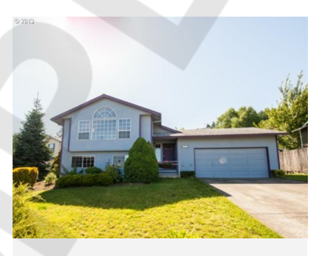
Subject Property Closed Sale Comp 2