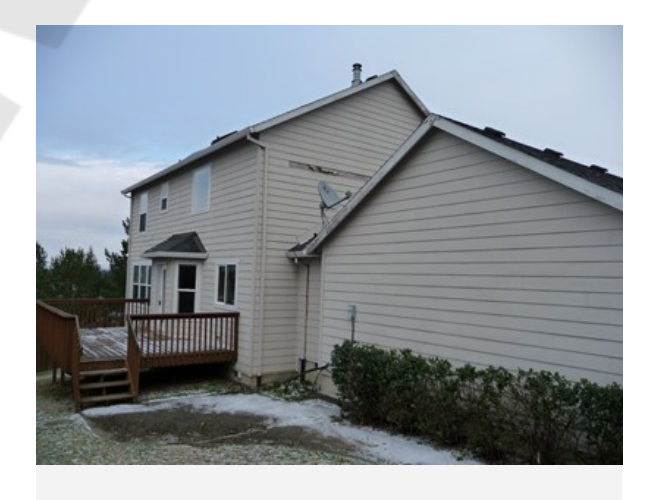
Area: Deck Deck Photo