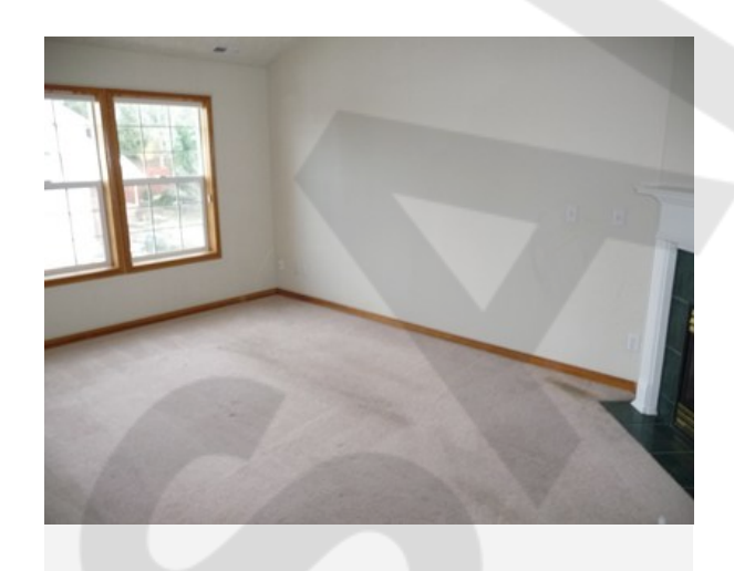
Area: Bedroom Bedroom Photo