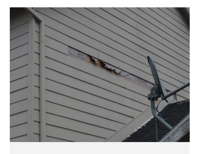
Area: Main Structure Repair For: Exterior Walls - Wood