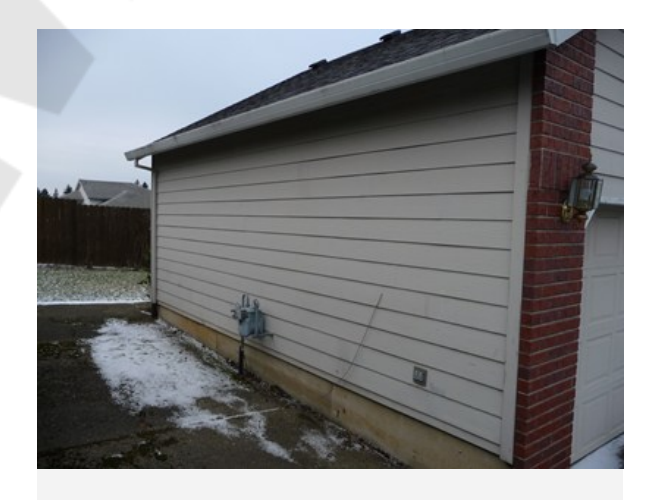
Subject Property Left Side