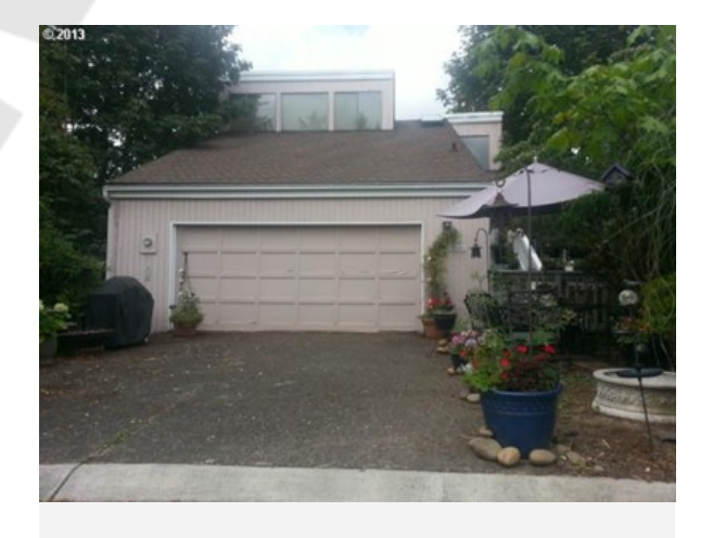
Subject Property Listed Comp 1